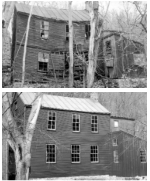
Bench and Blacksmith Shop, before (top) and after (bottom) restoration.