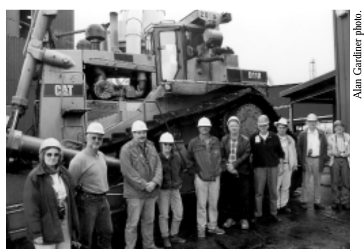
SIA members pose next to the biggest Cat bulldozer made, the D11, at the Superior Midwest Energy Terminal.