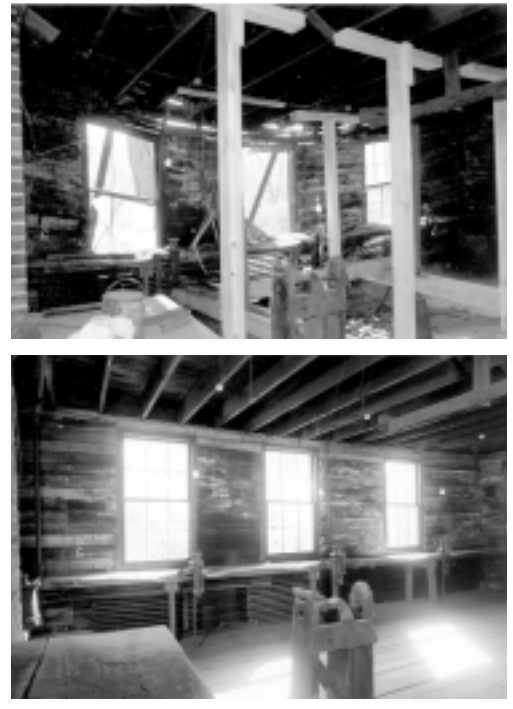
Interior of the Bench Shop, before (top) and after (bottom) restoration.