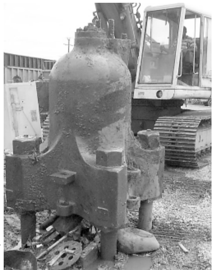
Does anyone recognize this object?

Does Anyone Recognize This Object? This large casting was buried for many years in a scrapyard in Ashland, Virginia. The origin and purpose are unknown; its weight is about five tons. The lower housing has a machined surface with a ring of bolt holes. The large bellshaped chamber has a pipe running longitudinally through its center. Four 6-in.-diameter bolts extend through the corners, and they are thought to be part of a slide mechanism or perhaps a lower piston