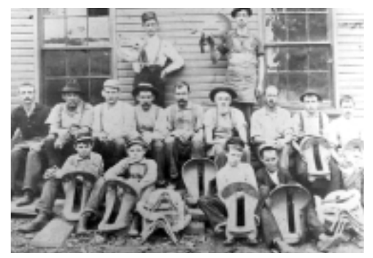
Schroeder workers and saddletrees, ca. 1880.