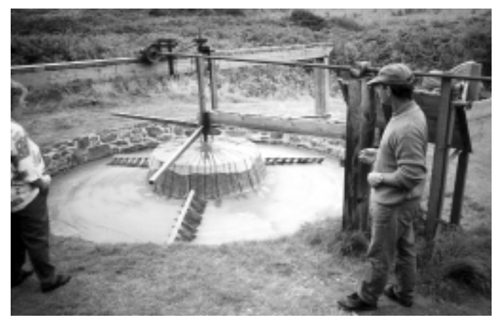
Colin Wills describes the operation of his convex buddle at the Blue Hills Tin Streams, where alluvial sand is still processed by historic methods in a working museum environment.