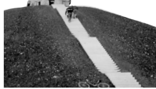
Imaginative scupture made of recylced industrial building foundations, erected on coalmine waste tip near Gilsenkirchen.

lans are under way for an SIA-sponsored study tour of Germany's Ruhr district in March 2001. After an exciting visit last year, I decided to organize a return trip for SIA members. The Ruhr is the heartland of German industrialization with a critical concentration of minerals, transportation, technology, and population to support one of the world's premiere industrial centers. In addition to extensive