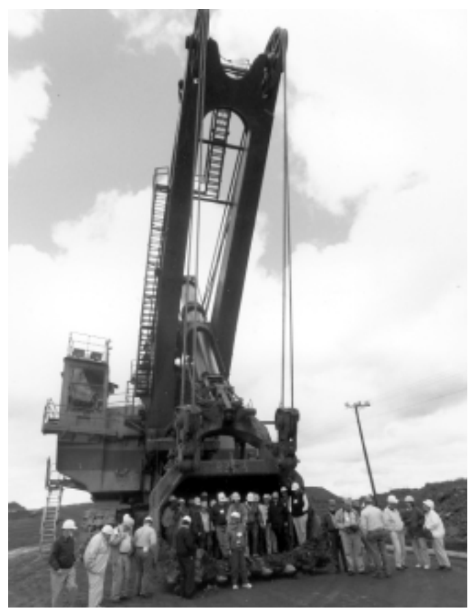
SIA members in the 33 cubic-yard bucket of a shovel, LTV taconite mine, Hoyt Lakes.

The stop at the Duluth Steam Cooperative, a 1932 utility that