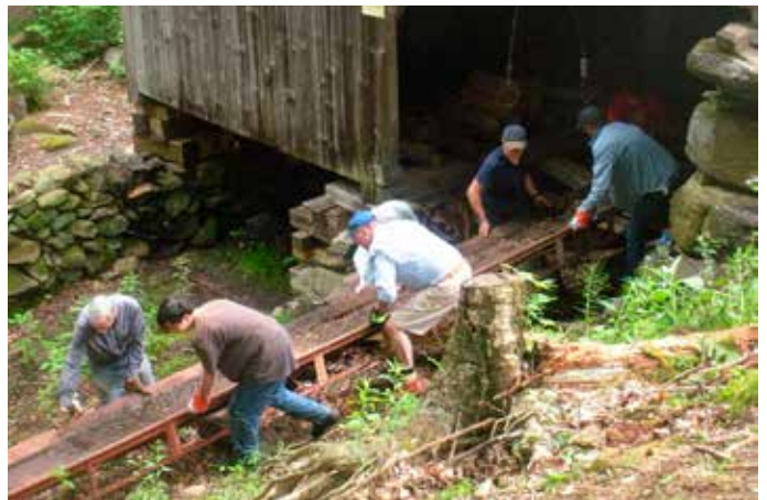
Volunteers remove a hay conveyor that had been used to carry sawdust from the Chamberlin Mill, 2012.