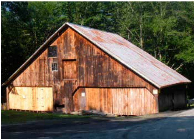
Chamberlin Mill, view from the east.

While waterpower sawmills were once familiar sights in New England towns, dotting nearly every running stream in this naturally forested region of the country, and serving to provide much needed lumber for the farmsteads and villages we now claim as the part of the architectural landscape, these mills gradually gave way to portable steam operations and, ultimately, large distant producers of lumber. Almost all of the structures have disappeared. Because of the Chamberlins' tenacity and Yankee ingenuity, this mill has survived remarkably intact. Now, a tenacious community is resolved to keep this rare treasure alive for future generations to enjoy.