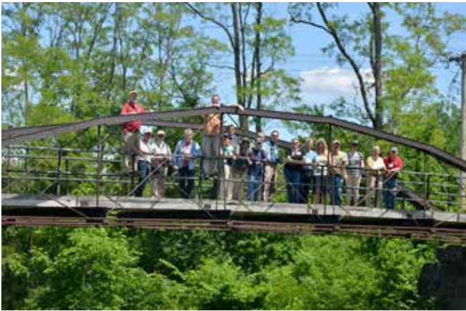
Vischers Ferry Bridge, a Whipple bowstring of 1869, gets some love from the SIA bridge tour group.