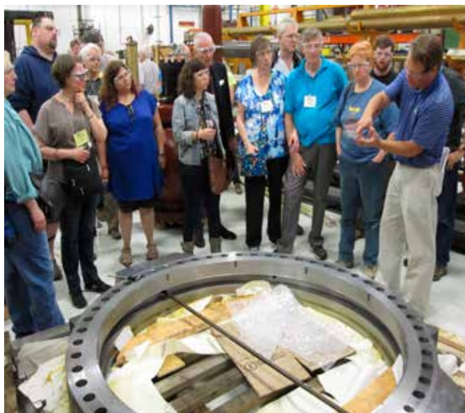
SIA at Ross Valve.