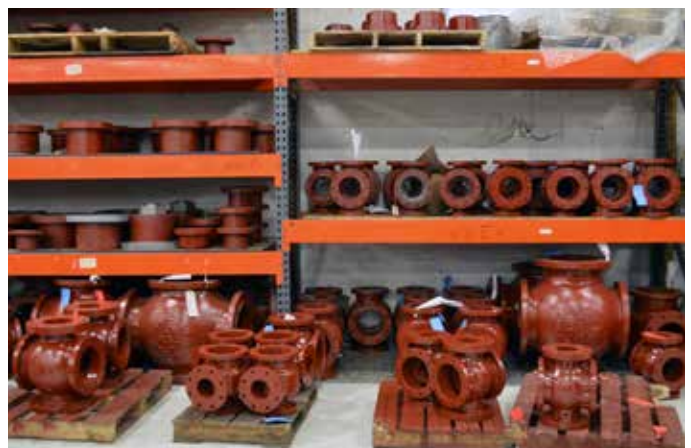
Castings at Ross Valve.