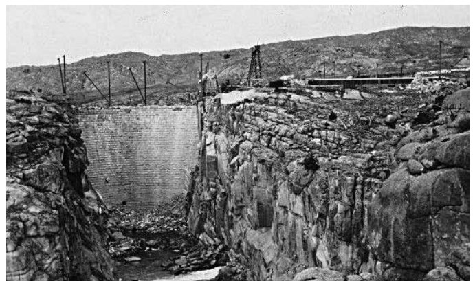
Construction of the Pathfinder Dam, c. 1908.

Murphy Grist Mill , Beekman, N.Y. Built in 1889, the two-story mill has been rehabilitated as a small museum and community meeting space.