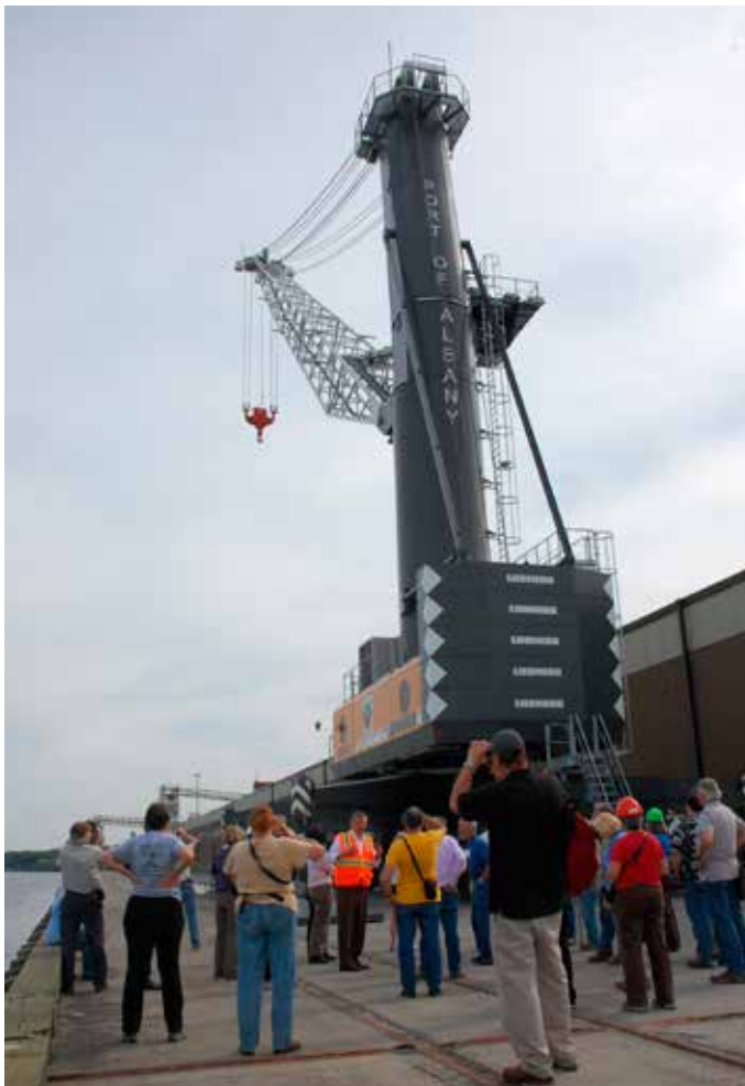
Port of Albany.