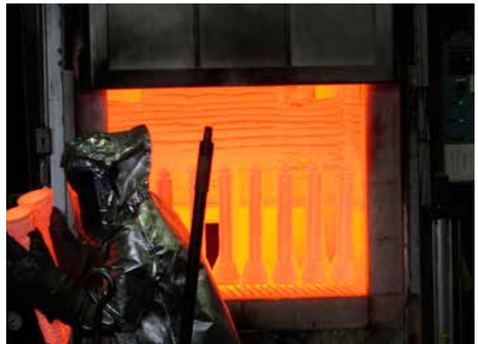
Worker at AMT removing a heated shell for casting.