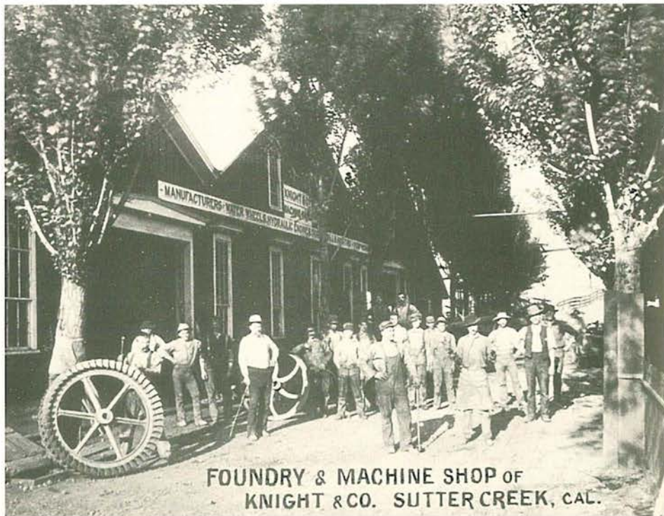
An early view of Knight Foundry in Sutter Creek, California. Knight will co-host the SIA's 1996 Annual Conference.

If enough prospective conference attendees indicate interest, Knight Foundry will schedule its Industrial Living History Workshops before and after the conference (May 24-26 and June 7-9). Each three-day workshop includes an overview of 19th-century manufacturing processes; intensive sessions in the foundry and in the machine, blacksmith, and pattern shops; and cupola furnace preparation and pour. Knight encourages participants to produce castings that they may require for their own projects. Workshop students have made replacement parts for engines and tractors, scale-model parts, and even some artwork, although a special project is not necessary to participate.