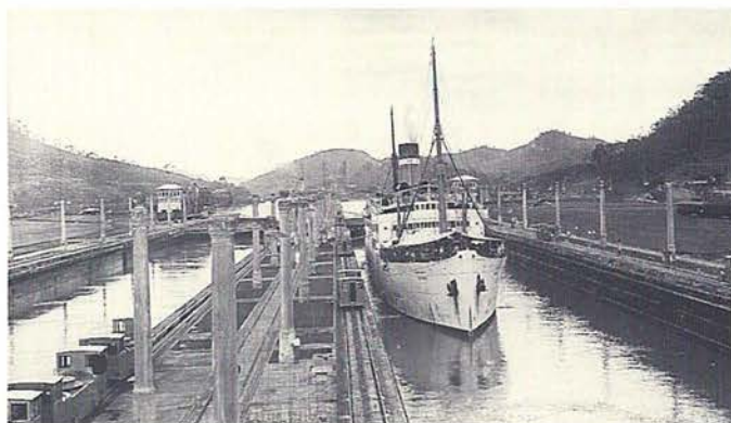
Above: In 1914 the U.S. Grant becomes the first ship to transit the new Canal.

Below: One up and one down at Miraflores Locks in the 1970s.