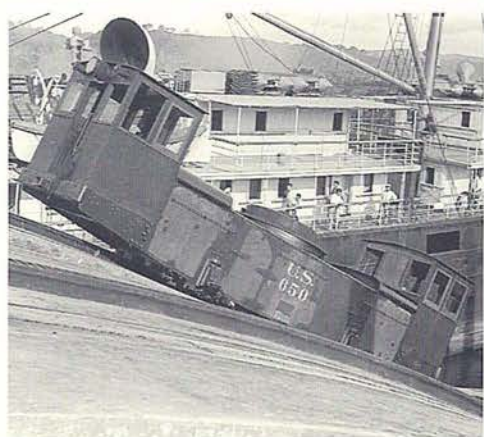
Left: A double-headed mule—lock locomotion in the 1950s.

Below: The Bridge of the Americas in the 1960s.