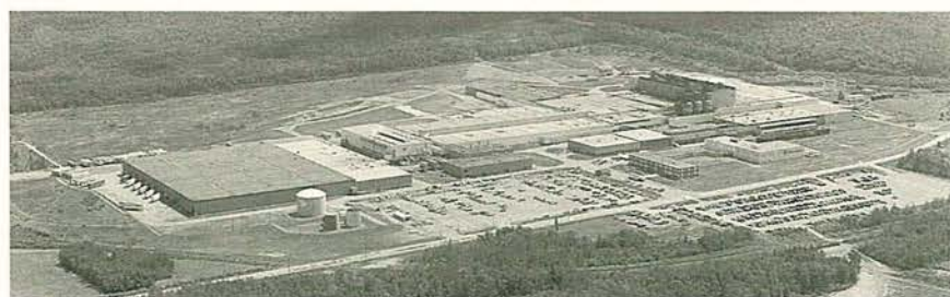
PROCESS-TOUR SITES ON THE SIA 1995 FALL TOUR.

Above: The massive Granton Plant of Michelin Tire.