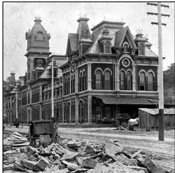
Union Depot in Kansas City, Union Depot, which opened in April 1878 in an area now known as West Bottoms.

* Additional fees apply for activities marked with a star