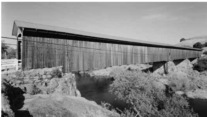
HAER CA-314.

NB—Also designated NHLs were the Denver & Rio Grande Railroad San Juan Extension (N.M.–Colo.) and the McKeen Motor Car #70 (Carson City, Nev.) .