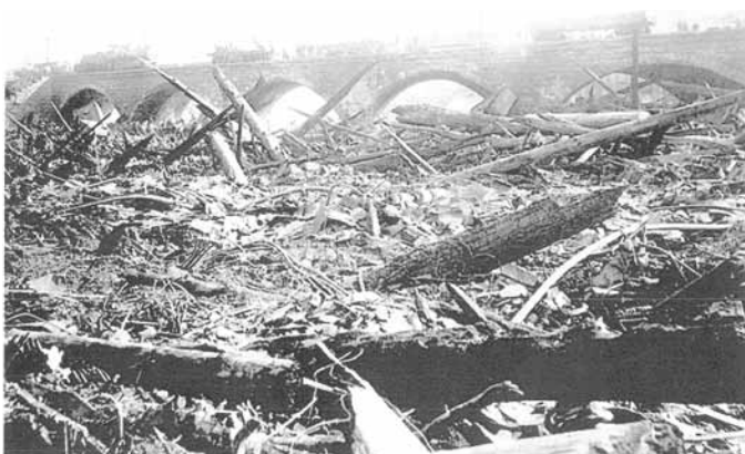
The stone-arch bridge with debris, following the flood of 1889.