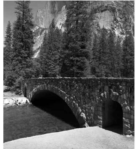
HAER CA-22. Brian Grogan, 1991

park is in the position of having to choose between the two. The final decision, which is not expected until sometime in 2013, is being watched closely by preservation groups that have become alarmed in recent years that the nation's environmental policies related to returning rivers to pre-modern, free-flowing conditions have little regard for the cultural value of historic resources like bridges, dams, and mills.