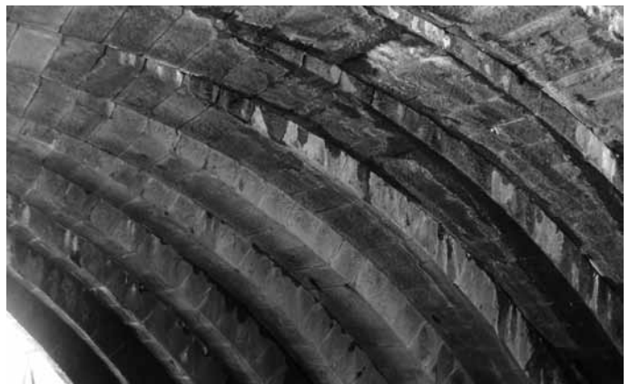
The Johnstown Bridge's ribbed arches.