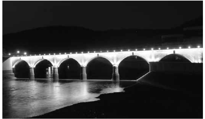
The PRR's Conemaugh River Viaduct, Johnstown, Pa., lit at night.

The stone bridge has been documented by the Historic